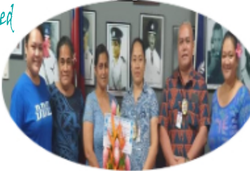
BBE & DEPUTY COMMISSIONERS

On the 5th of May 2021, SPPCS received a card, a cake and a bouquet of flower from the Betham Brothers Enterprises, as a token of appreciation to all the women in Policing, for taking up the risky role, in protecting the community, as well as the hard work dealt with day by day.